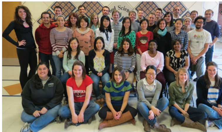
2014 Spring Food Science Graduate Students