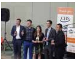
IAMA Case Study Team