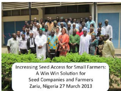
Nigerian Marketing Program