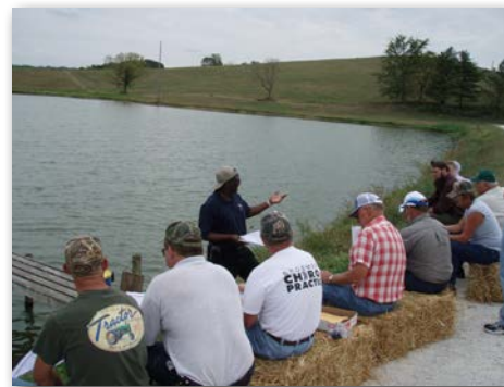
Aquaculture Extension Program