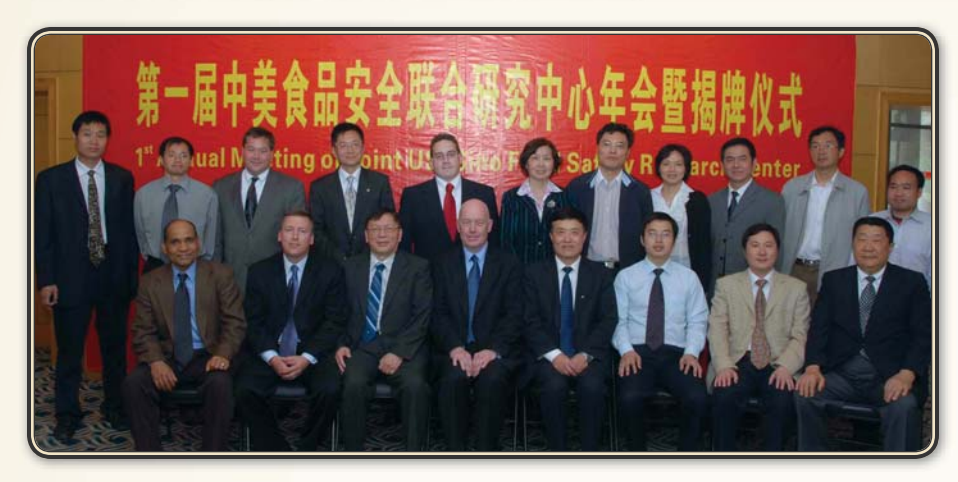
A group photograph with our new colleagues and friends from China.

Since the inception of the Center for Food Safety Engineering (CFSE) at Purdue, there has been a strong emphasis on interaction collaboration with scientists from the USDA-ARS Eastern Regional Research Center (ERRC) in Philadelphia, PA. This collaboration has been fostered through interaction between scientists annual Purdue-CFSE/ARS-ERRC research planning workshops, and annual participation by Purdue-CFSE and ARS-ERRC scientists in the Molecular Detection Symposium during the International Workshop on Rapid Methods and Automation in Microbiology at Kansas State University.