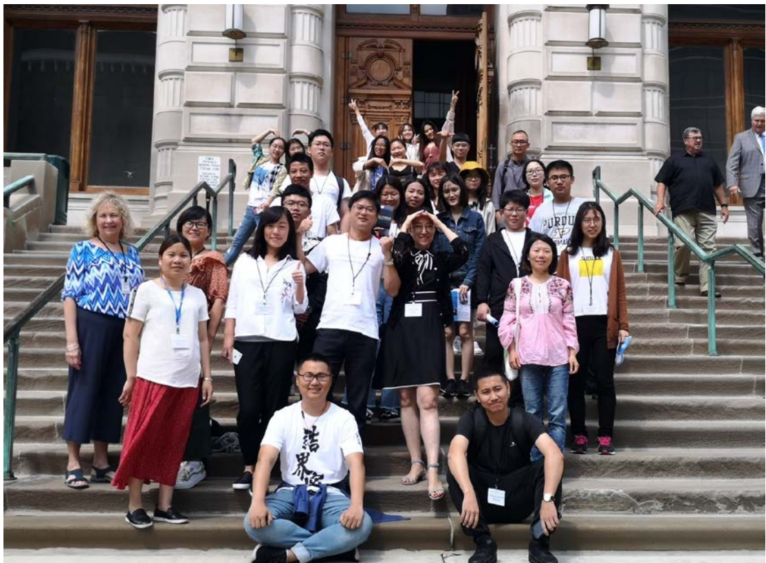
Visit the Indiana State Capital in Indianapolis