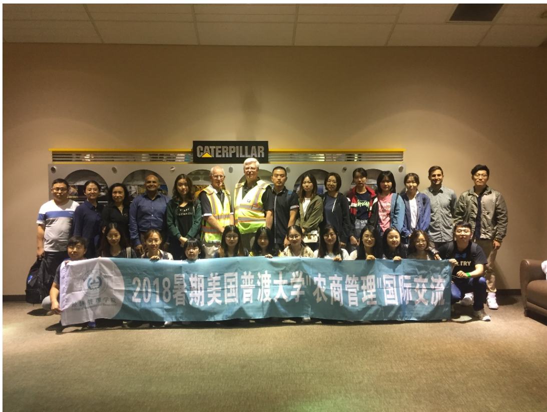
NJAU together with Purdue AgEcon Master students toured a Caterpillar manufacture plant at Lafayette, Indiana