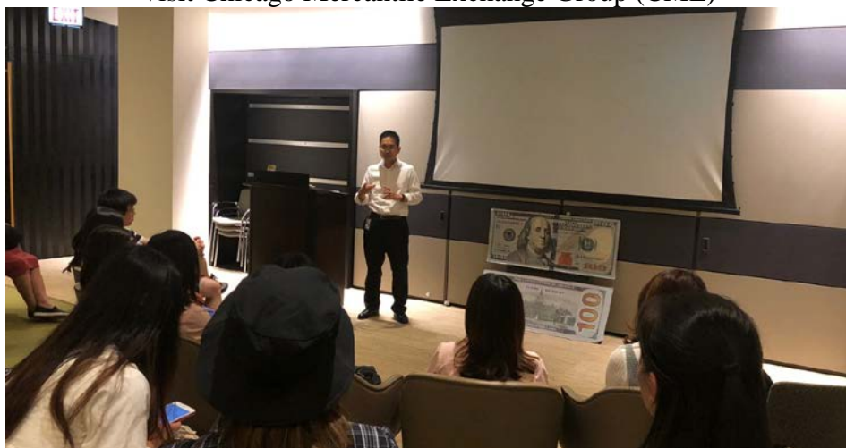
Visit Federal Reserve Bank at Chicago