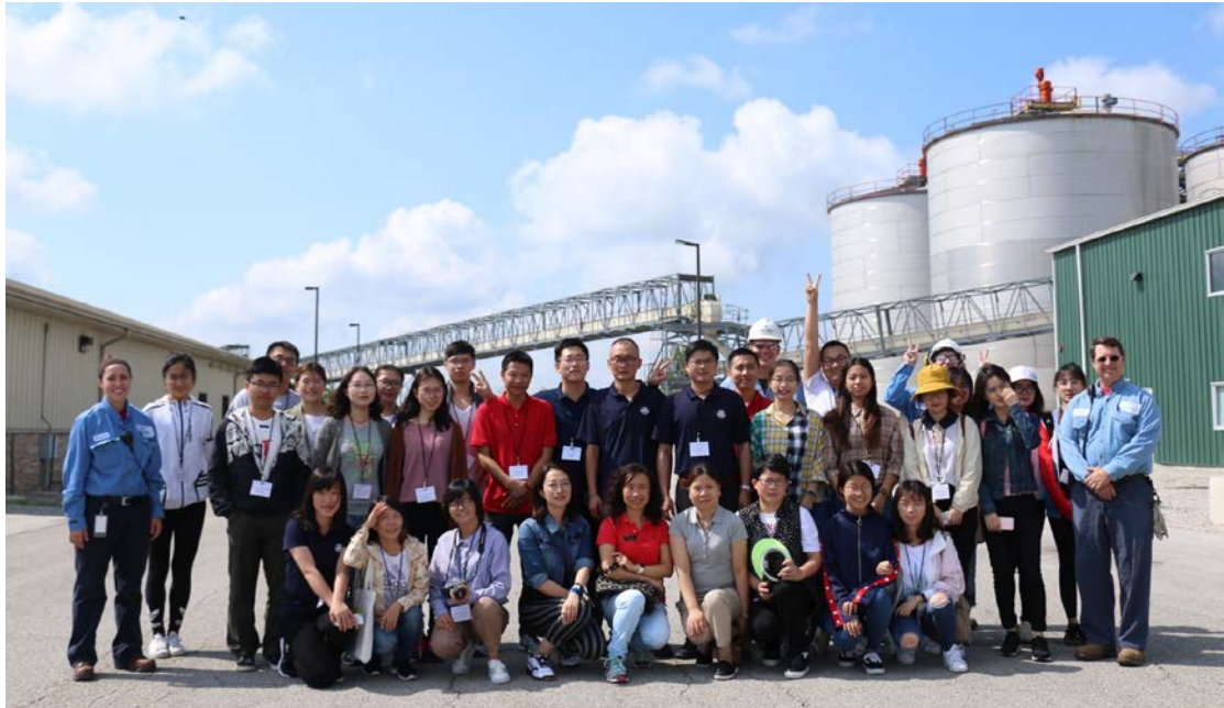
Visit Valero Renewable Energy corn ethanol plant