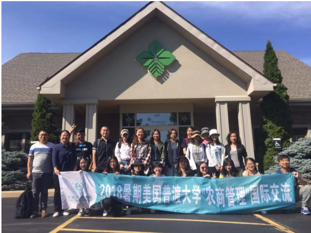
NJAU Students visited the Farm Credit Service at Lafayette, Indiana