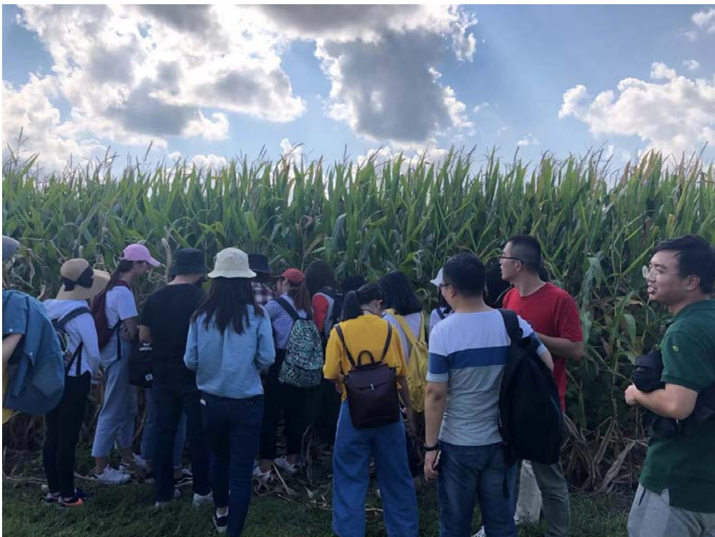
NJAU group went on field trip in the farm