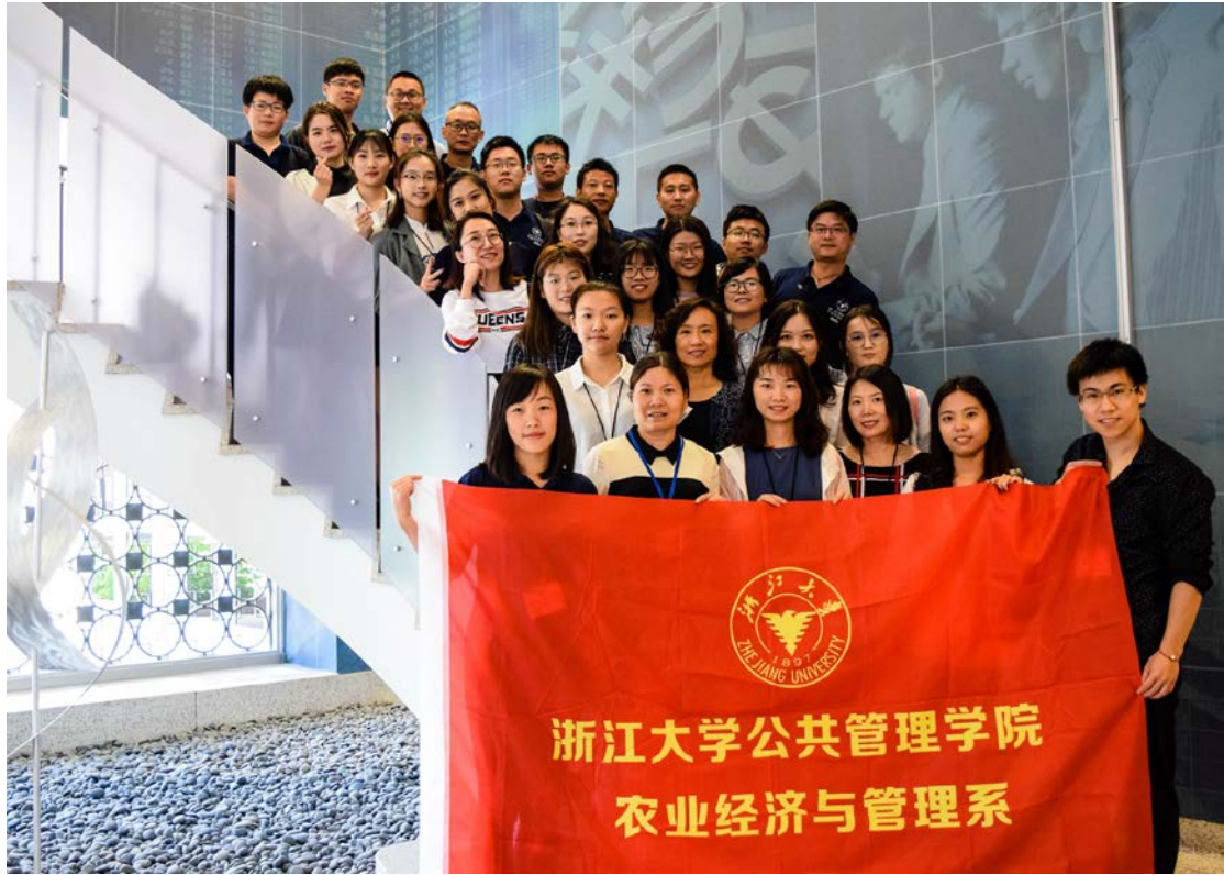
At Krannert Building