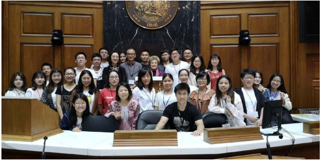
Visit the Indiana State House of Representative