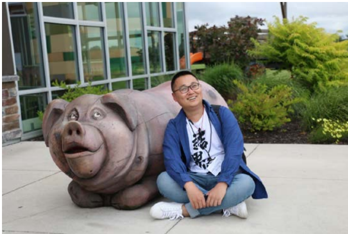
Visit Fair Oak Farm