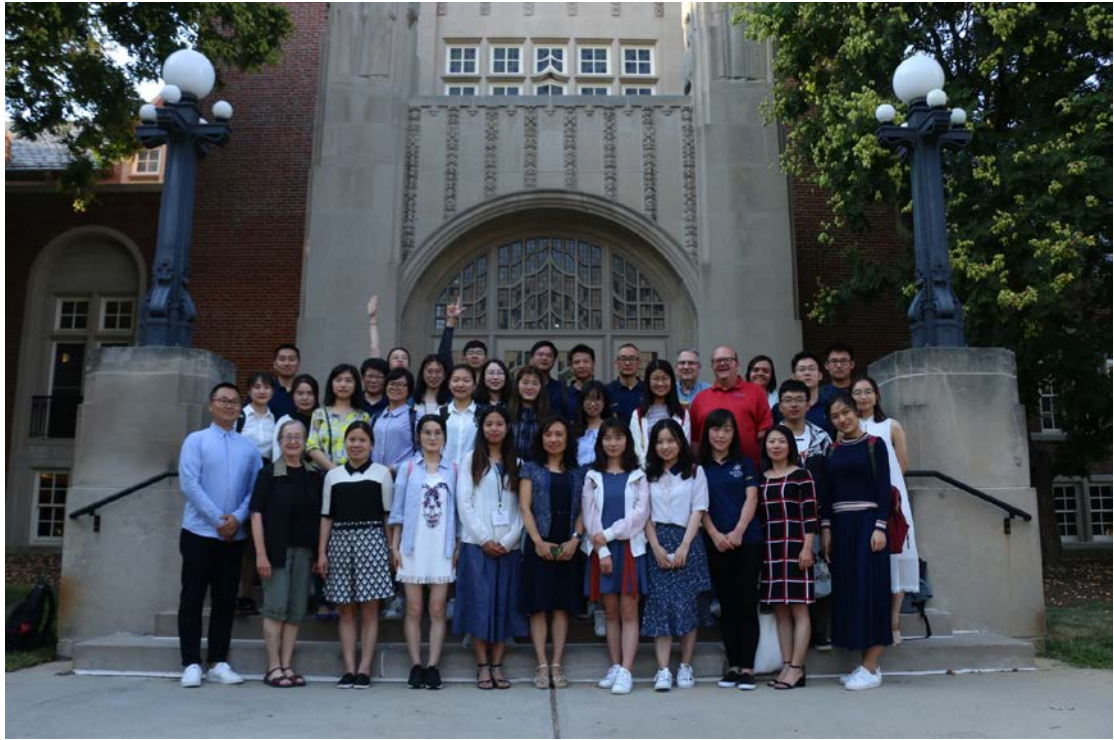
Front of PMU