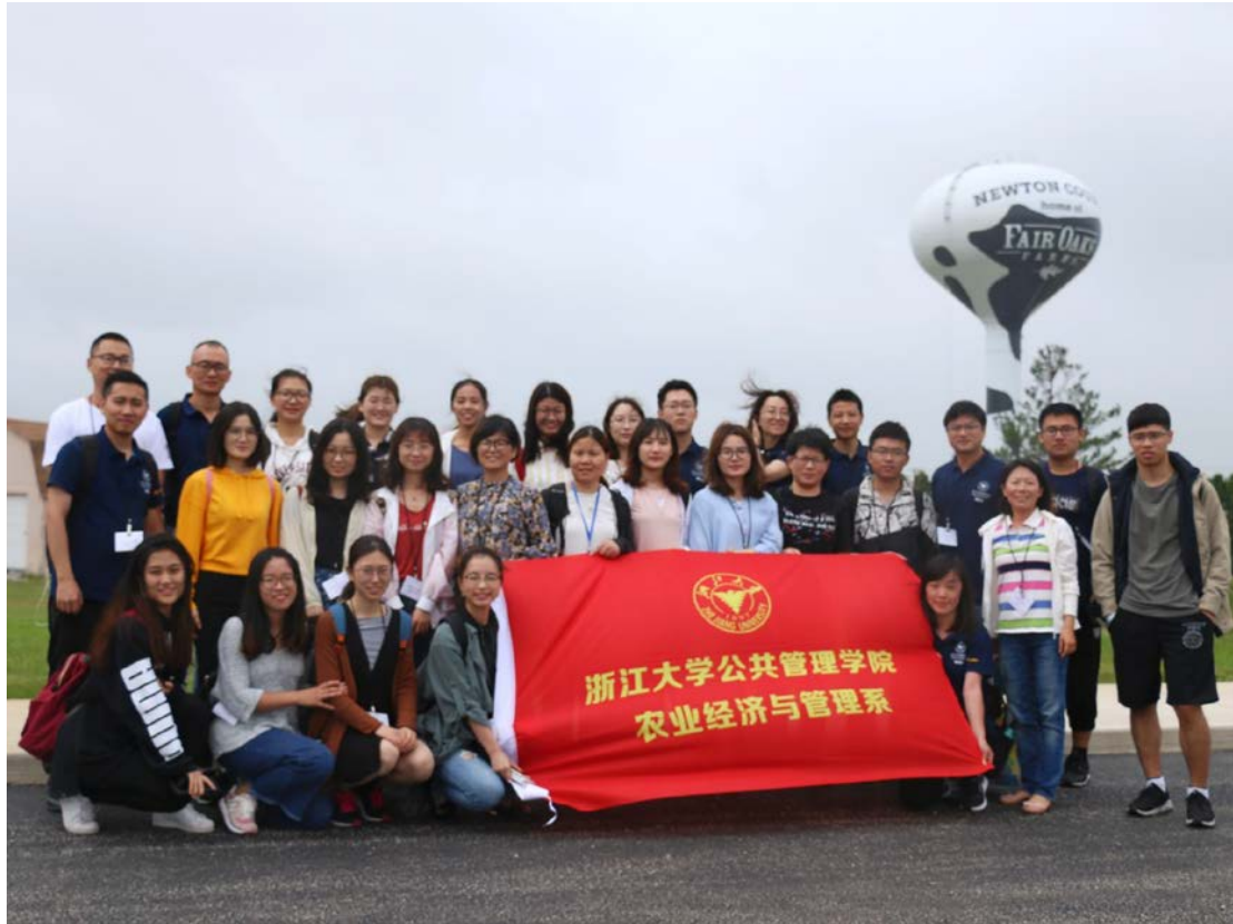
Zheda students visit Fair Oak Farm (1)