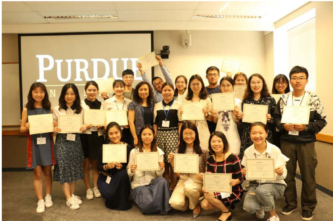
Zheda students finish with Certificates