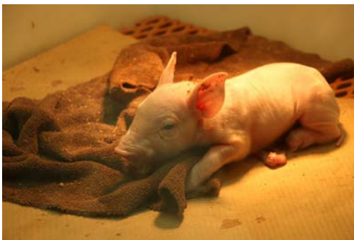
Visit Fair Oak Farm newborn piglet