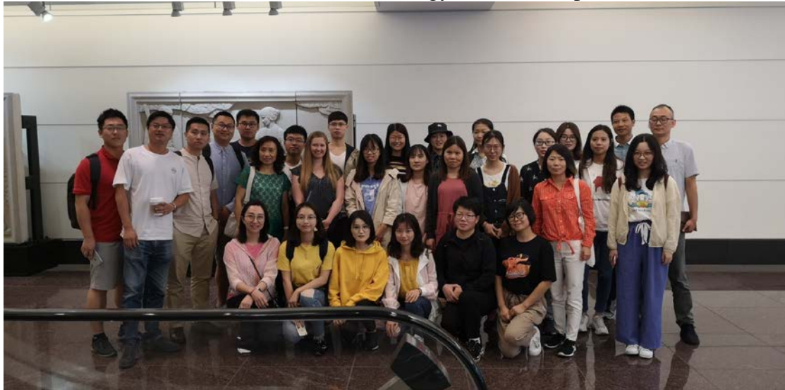
Visit Chicago Mercantile Exchange Group (CME)